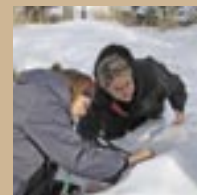
2 Teachers dig at Yellowstone