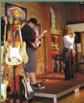
Oak Grove students perform in Old Town Temecula, with the guitars they made displayed at left.

“Making a guitar takes mostly patience, a little bit of love and a little bit of time,” one student wrote while another said “Guitar building educated me” and another, “It also kept me out of trouble. . .”